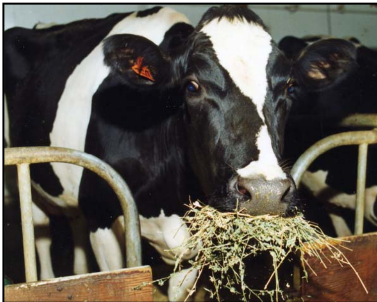
Dairy cow eating forage during a forage palatability trial at the U of S

that dairy cows could only eat about 1% of body weight daily as NDF and 1.2% of body weight in a total mixed ration. By the mid 1980s Penn State researchers showed the importance of forage particle size and the need for particles long enough to provide effective fibre for rumen fermentation. Small particles don't stay in the rumen long enough to be fully fermented.