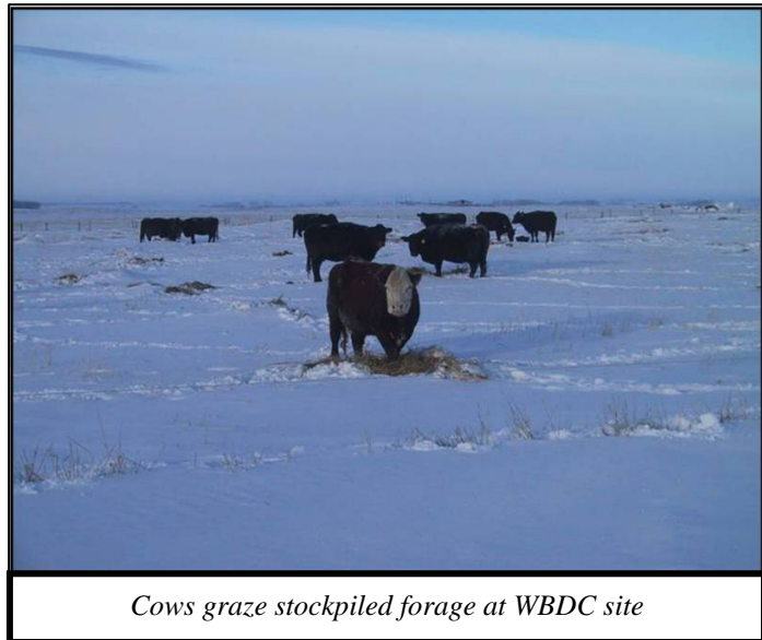
Cows graze stockpiled forage at WBDC site

The Western Beef Development Centre near Lanigan, SK and two producer co-operators (located near Biggar, SK and Ituna, SK) provided the three sites included in this project. Treatments at each site included: swathed stockpiled forage and standing stockpiled forage, with each treatment grazed during the traditional winter feeding period. The co-operators swathed forage late in the summer and fall season (2009) and grazed the treatments later into the fall and into the winter months (2009/2010). Co-operators recorded grazing periods and grazing animal days for each treatment. Utilization on each of the stockpiled standing and stockpiled swathed grazing treatments was assessed by the number of animal grazing days available at each site and treatment. Feed samples were collected and analyzed to quantify any differences in quality between the two grazed treatments at each site.