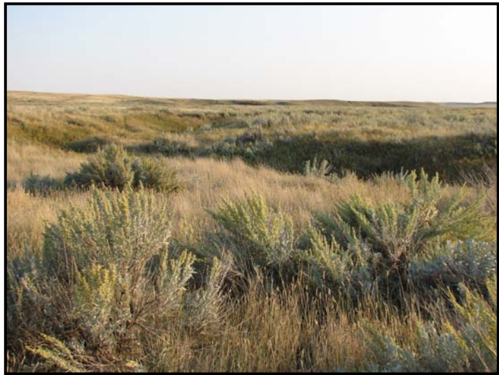
Native prairie pasture

However, true or not, that comparison of land used for different foods does bring to light an important point. The major component in a bovine’s diet is grass and forages. Beef cows will